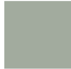
Sea Foam TW-108