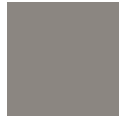
Evening Oak TW-116

The colors shown are approximate and, as close as possible, represent sealed areas of relief or texture on stamped concrete where TiqueWash will puddle and dry to achieve its darkest, most concentrated color. NewLook International, Inc.™ cannot control (and is not responsible for) application methods, job site conditions, finishing techniques, curing methods or other job site variables and, therefore, cannot guarantee the final appearance, adhesion or an exact color match. Texturing or finishing techniques, such as brooming or troweling, the use of sealers and slight color-drifts in raw materials will produce variations in color. NewLook International, Inc. strongly recommends representative job site samples (mock-ups) prior to project installation. NewLook TiqueWash is ideal for both interior and exterior, commercial and residential stamped concrete.