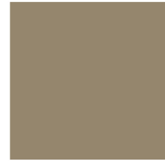
Seasoned Earth TW-112