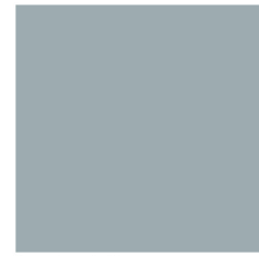
Arctic Chill TW-104